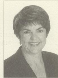
Carole James, MLA (Victoria-Beacon Hill)

Province of British Columbia Legislative Assembly